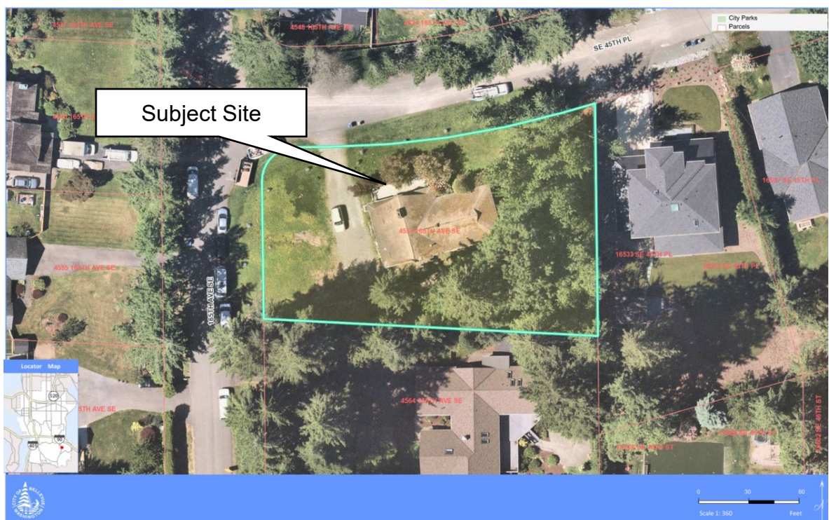
Figure 2 – Aerial Photograph

The topography of the site is mostly flat with a minimal grade change that slopes gradually downward from south to north with an elevation change of approximately 4 ft. The predominate vegetation on-site is grass with trees and ornamental planting areas. Access to lot one will be via a new driveway fronting SE 45 th Place and access to lot two will be via a new driveway fronting SE 45 th Place, the final location for the lot two driveway has not been determined.